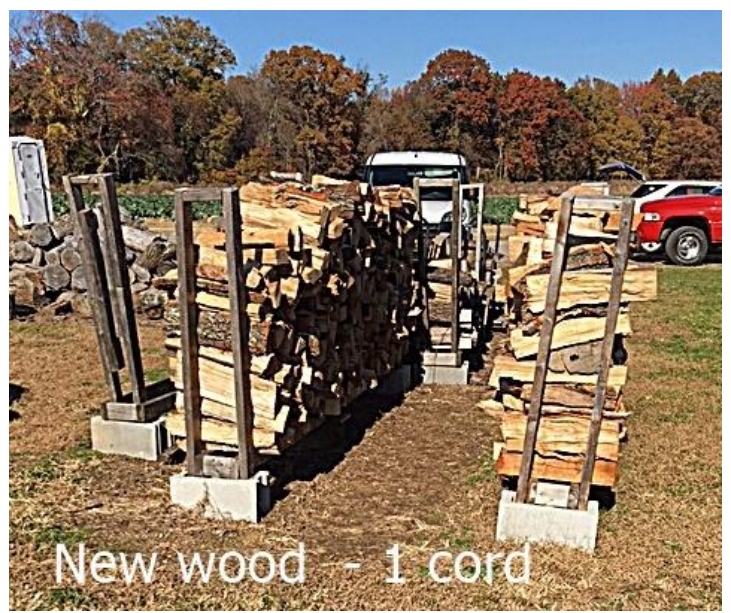
Related note , our tree climber, Dave, has been adding to our pile of big wood chunks.

Remember to use them when burn barrel is blazing.